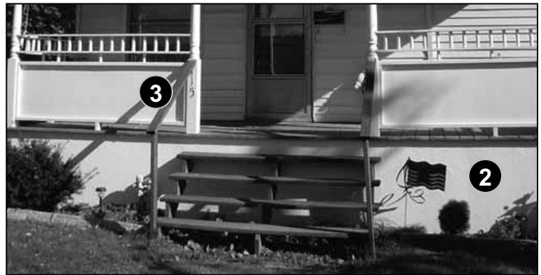
Fig. 5-6: 115 McKinley St. The front steps and railings up to this porch do not match the original porch design, and are instead constructed of standard framing lumber. The porch railings have themselves been replaced with blank wood panels which changes the scale of the facade. The underside of this porch has been completely enclosed as well, and likely does not provide enough ventilation to prevent moisture buildup and rot.