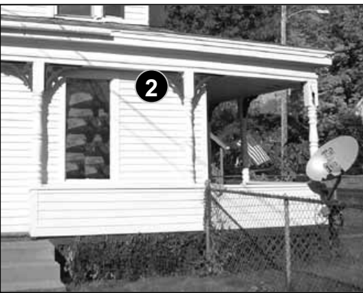
Fig. 5-7: 138 River St. The front porch of this structure has been partially filled-in with an addition.