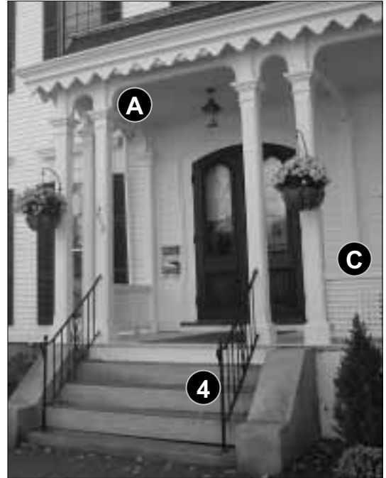
Fig. 5-1: 213 Main St. The ornamentation has been retained along the eaves, columns and porch railings, but the stair railings have been replaced with wrought iron.