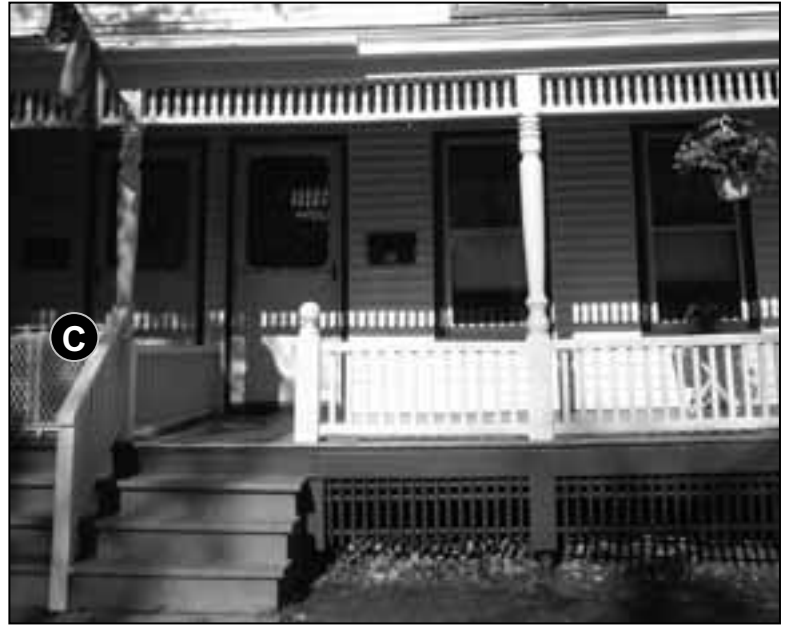
Fig. 5-4: 202 Main St. The front steps and railings up to this porch are similar to the style and character of the porch overall, and are painted to match. The underside of the porch is concealed with grillwork which allows the structure underneath to breathe.