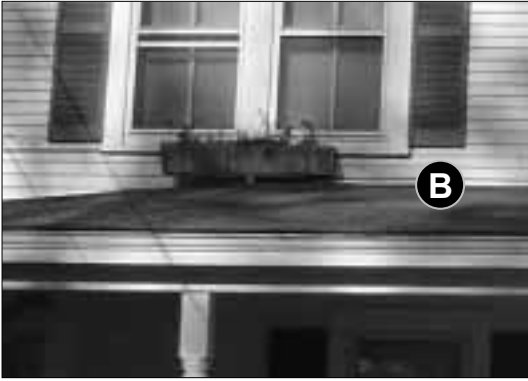
Fig. 5-3: 206 Main St. Porch roofs should be flashed properly and kept at least 10" below any windows to help prevent snow and water build-up at the window sill.